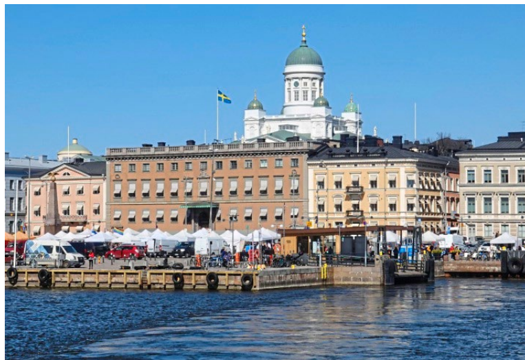
While Finland maintained its place at the top of the World Happiness Report rankings, many western countries reported disconcerting drops

"To think that, in some parts of the world, children are already